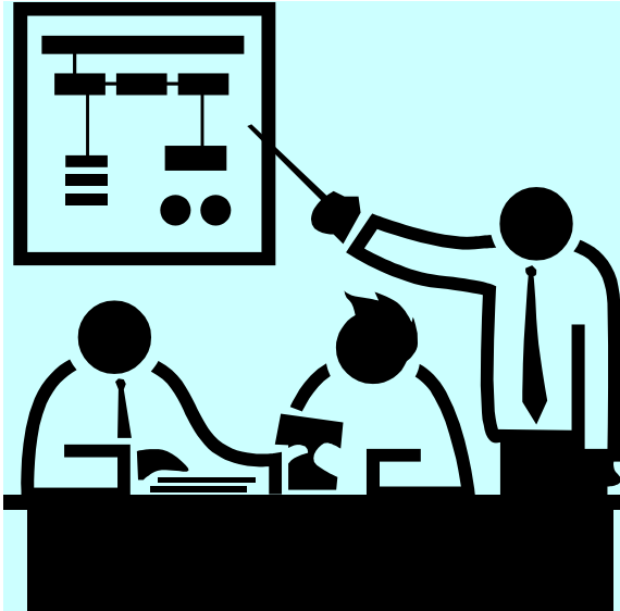
Structure of the city/town government

Council meeting can be held during a school assembly or even at the city or town hall; the meeting should last approximately 30-45 minutes.