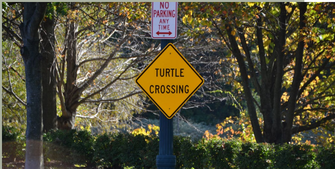
Engineers from Rockville's Department of Public Works took special care to help Watkins Pond's turtles to relocate during a recent stormwater management project.